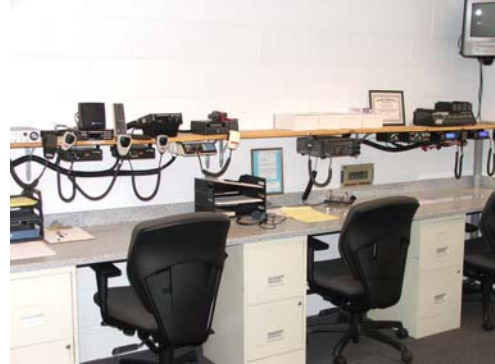
Belmont County Radio Communications Center.

The Eastern Ohio Amateur Wireless Association (EOAWA) was the host of the Multi-County Coalition meeting held on Sunday, November 11 at the Belmont County Emergency Operations Center. There were twelve hams and one guest in attendance.