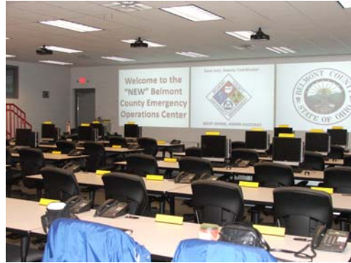
Belmont County's New Emergency Operations Center.