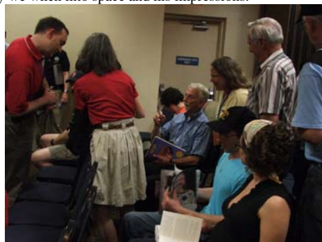
The gentleman in the light blue shirt, seated in the middle, is his father Owen Garriott, W5LFL, first ham in space.

Saturday's forums consisted of contesting, space explorer Richard Garriott, youth in amateur radio, DX, SATERN, ARRL members, Newline town meeting, FCC, ATV, Lightning protection, Heil Sound—Ham station audio, RTTY, ARRL getting started in digital contesting, ARES, Collins, VHF/UHF/Microwave, AMSAT, SSTV, and MARS.